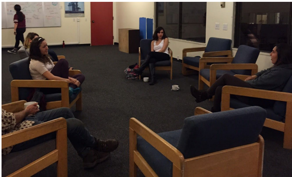
The last World Cafe of winter quarter - "What is your Theory of Social Change"