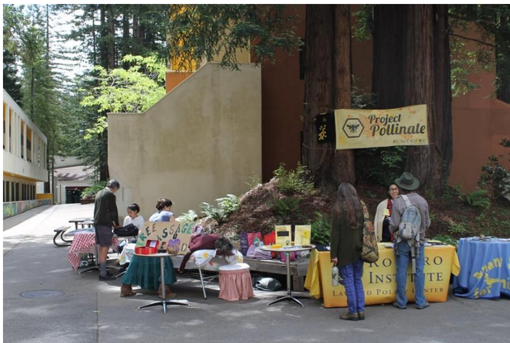
All the organizations tableting for the Bioneers Conference!